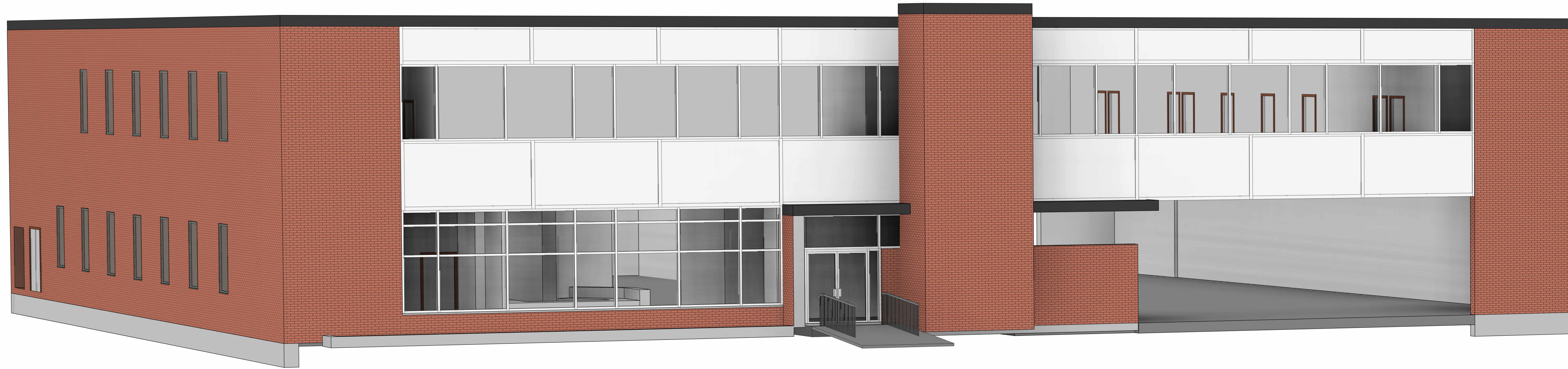
1 A-4.4 SOUTHEAST PERSPECTIVE VIEW